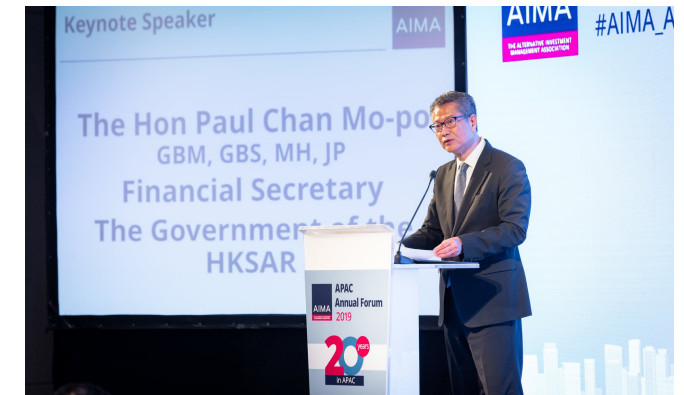
The Hon Paul Chan Mo-po, Financial Secretary, The Government of the HKSAR

Paul Chan Mo-po set an upbeat tone by assuring the industry of a warm welcome in Hong Kong, underlining the region's continuing role as a major financial centre and pledging its government's commitment to creating and maintaining a conducive climate for firms thinking of basing themselves there.