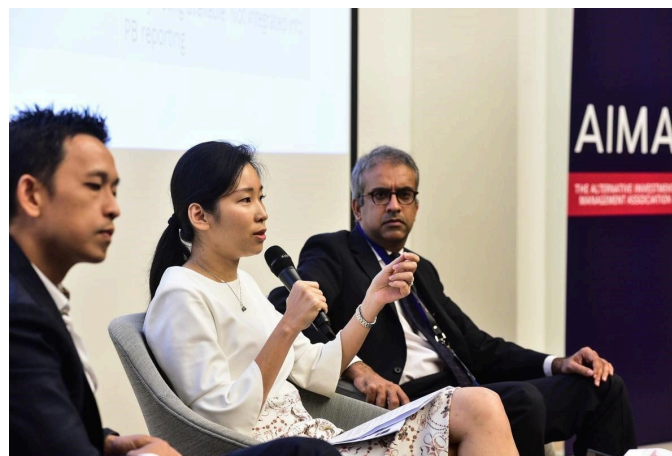
Singapore Annual Forum 2018: Pre-Forum Workshop 2: Why Asia's emerging markets are not emerging. Featuring speakers from the Singapore Exchange, Goldman Sachs and Herbert Smith Freehills

We also launched, together with the Chartered Alternative Investment Analyst Association (CAIA), a series of CAIA scholarships across the region. Scholarships were presented by CAIA to recipients at every AIMA Forum event.