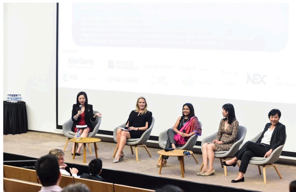
Singapore Annual Forum 2018: Why Diversity Matters: Featuring speakers from Eng & Co LLC, BNY Mellon, BlackRock, Edelweiss, UBS

2018 has seen a well-rounded effort from all the AIMA APAC centres. We are always grateful for the support given by the AIMA membership and look forward to working together in 2019.