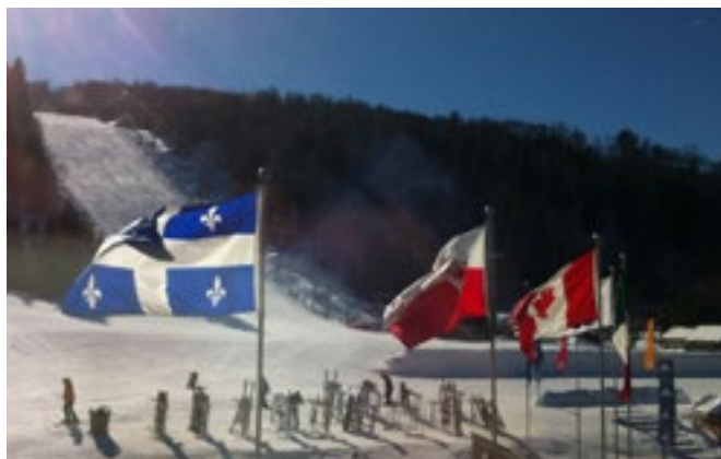
The inaugural Ski Day Québec at Mont Saint Sauveur was a perfect day for skiing and meeting friends at the lodge.

The BCC is planning about 2 educational and 2 social events each year, commencing with a social event in spring 2013.