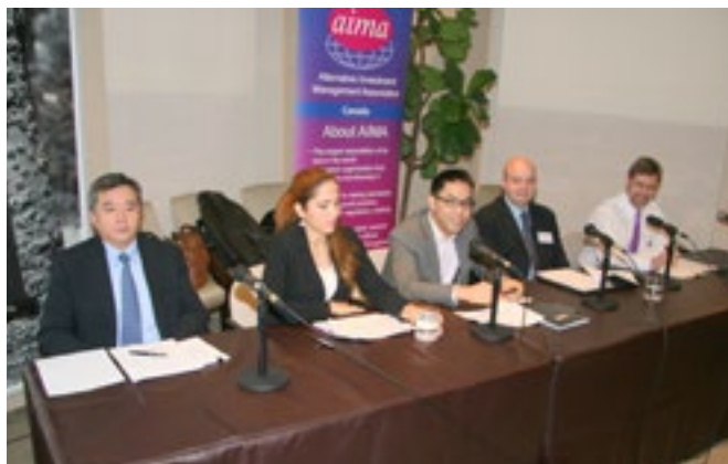
Panelists ready themselves for the Emerging Managers: Operational & Compliance Considerations event.