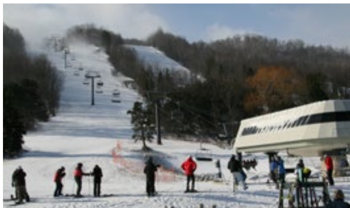
Ski Day at Osler Bluff is always a great time to connect with nature and fellow industry participants.