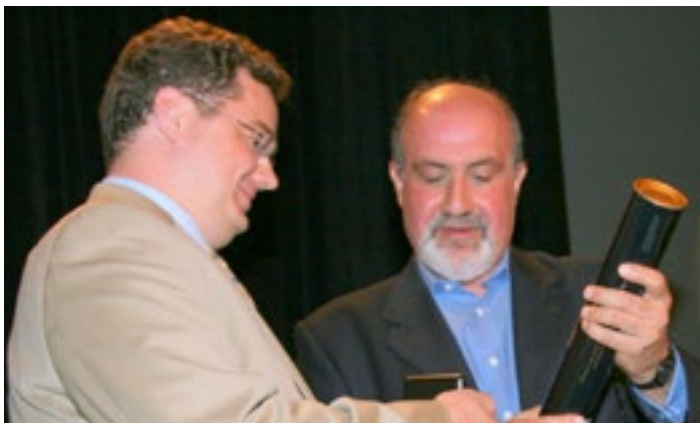
Nassim Taleb accepts thanks and gifts for his talk to hundreds in Toronto.