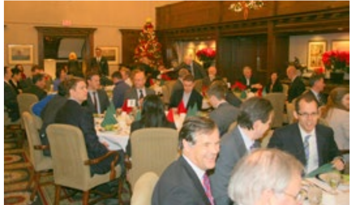
A full crowd for the first event in the Benchmarks Series: 60/40 is Dead; Long Live 60/40