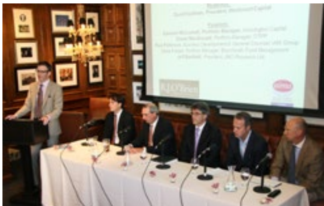
The distinguished panel faces a capacity crowd for the Managed Futures Committee's Introduction to CTAs event.