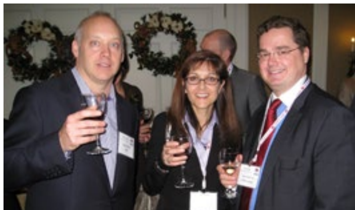
Members enjoying a beverage with AIMA COO at the annual Wine and Cheese in Toronto.