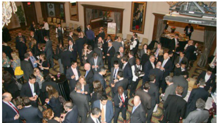
The room begins to fill for the 10th Anniversary event.