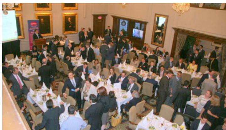
Attendees getting seated at the packed-house 10th Annual Debate .