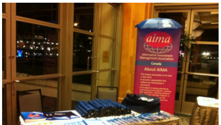
WAISC Vancouver booth for AIMA Canada is well-stocked with umbrellas (it rained that day, too).