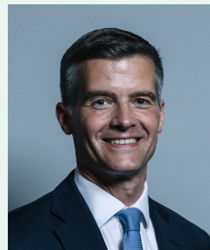
Rt Hon Mark Harper

Member of Parliament for Islwyn Chair, APPG on Alternative Investment Management